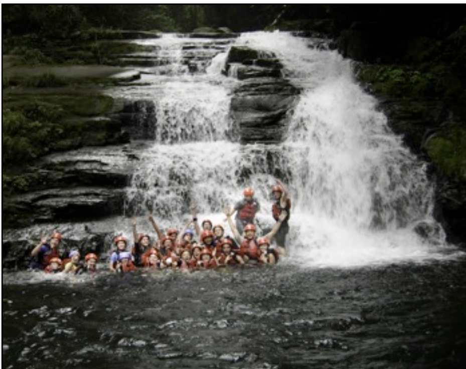
Left: The entire Costa Rica crew at the end of their whitewater adventure.