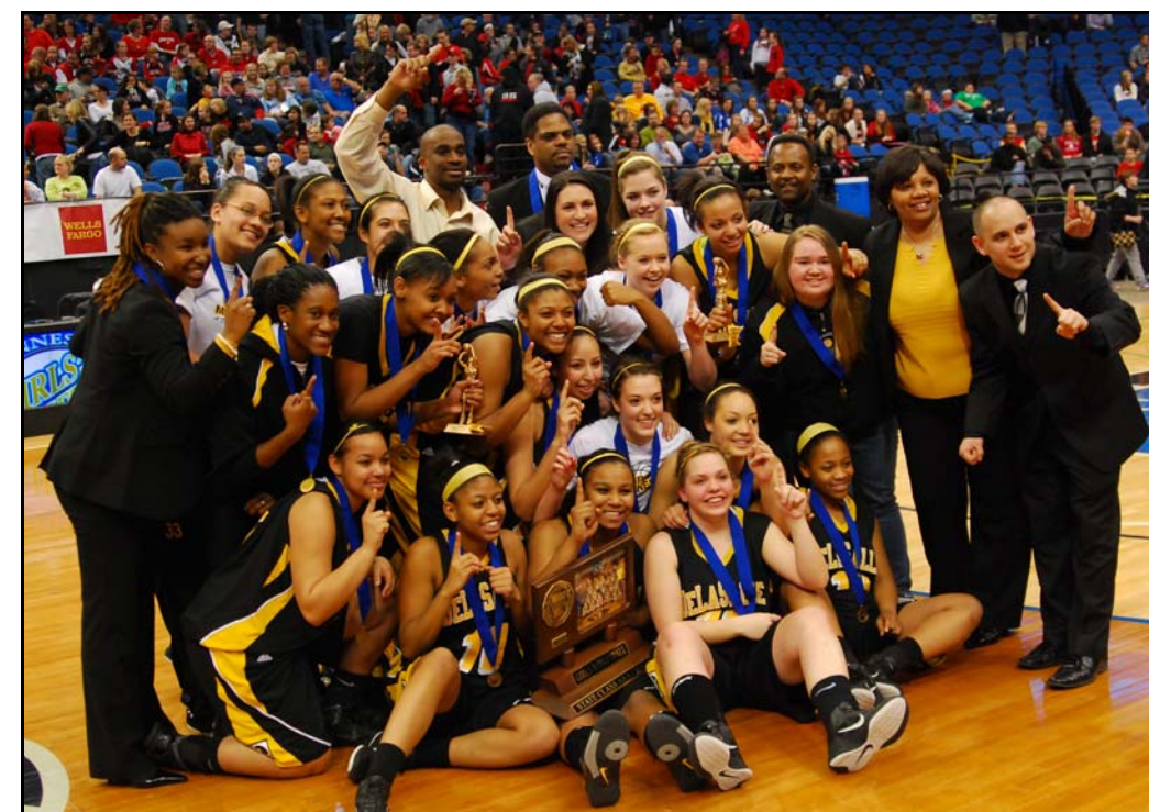
The 2011 Islanders celebrate their first Class AAA first place finish. Following a semi-final 55-46 victory against Benilde-St. Margaret's, the girls went on to defeat Hill-Murray 63-43. Both games were close until the final minutes of play. Though a very young team, with ten sophomores, six juniors, and only two seniors on the varsity roster, DeLaSalle finished with a 27-4 season record.

Meanwhile, in the same week as the girls' State tournament, the boys' basketball team fell just short of a return appearance in the State tournament, falling in the Section 3AAA final. Finishing with a 25-4 record, the